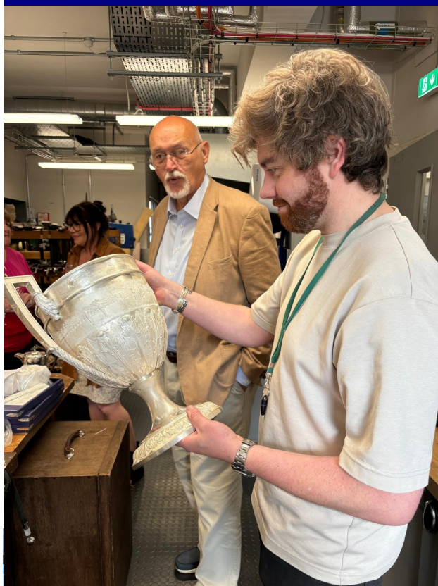
PHOTO GALLERY EDINBURGH TATTOO