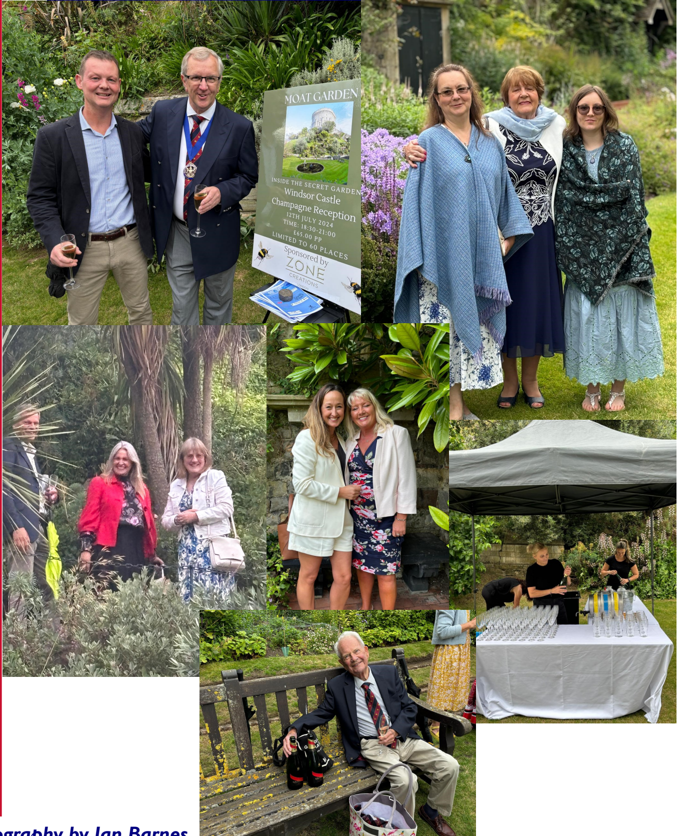
PHOTO GALLERY MOAT GARDEN RECEPTION