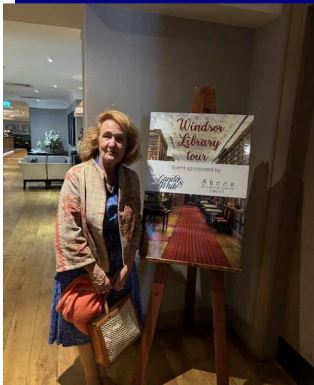
PHOTO GALLERY WINDSOR LIBRARY TOUR