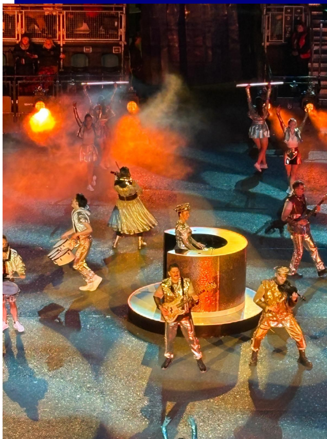
PHOTO GALLERY EDINBURGH TATTOO