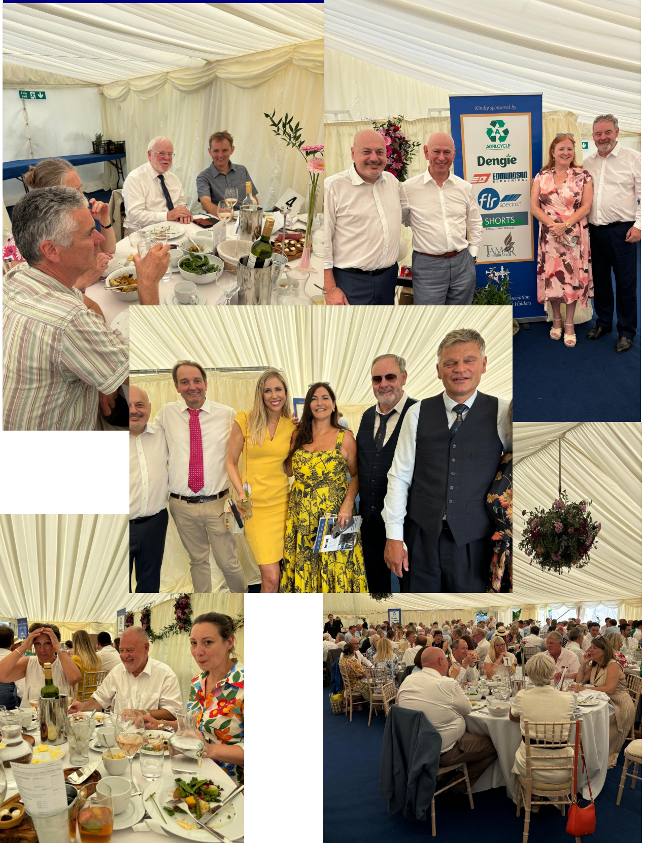
PHOTO GALLERY SANDRINGHAM FLOWER SHOW